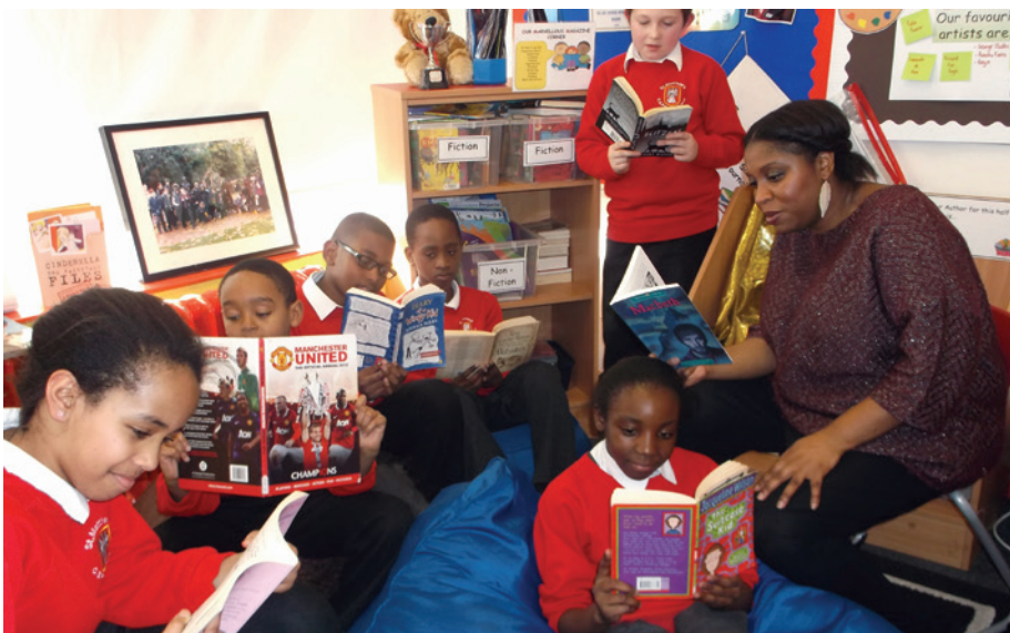
From Building Communities of Engaged Readers: Reading for Pleasure , Cremin, et al., Routledge

In this workshop we will share practical strategies to help engage the school and local communities in reading for pleasure. These include simple but effective ideas to involve all school staff, using social media (Twitter and blogging) to reach out to community, activities that families can do together and tips on how to capitalise upon parental and community expertise.